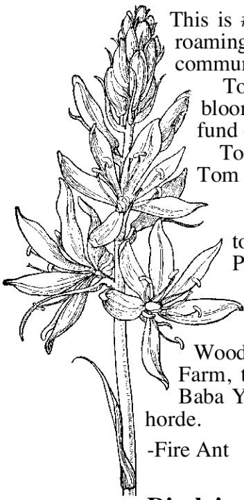
horde. -Fire Ant